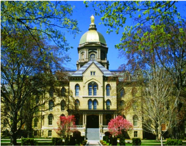
University of Notre Dame Main Building, Golden Dome