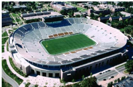
Notre Dame Hesburgh Library Notre Dame Stadium